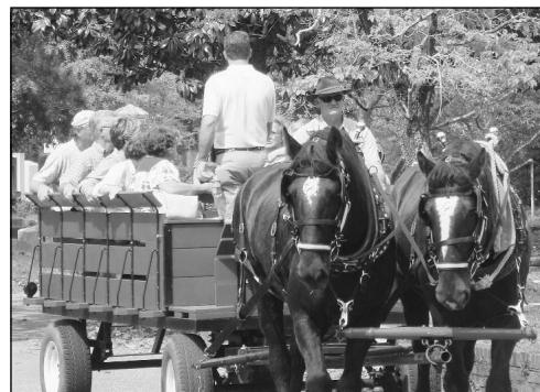
"Nip" & "Tuck" back by popular demand

North Carolina's oldest rural cemetery. Tours are offered every thirty minutes from 3:00 PM, with the last tour leaving at 5:30 PM. The fee is 10.00 for adults and $8.00 for children 12 and younger. (Friends of Oakdale members receive $2 off the price!) Mark your calendar now because this is something you won't want to miss! ❖