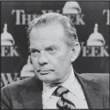
David Brinkley on the set of ABC's “This Week with David Brinkley”